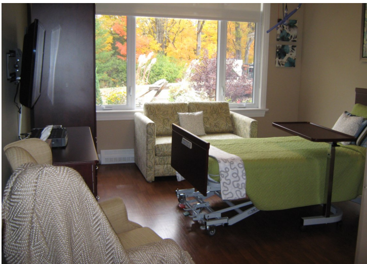
The completely refurbished rooms are beautifully appointed, calm and comfortable, and feel more like a home bedroom than an institutional room.