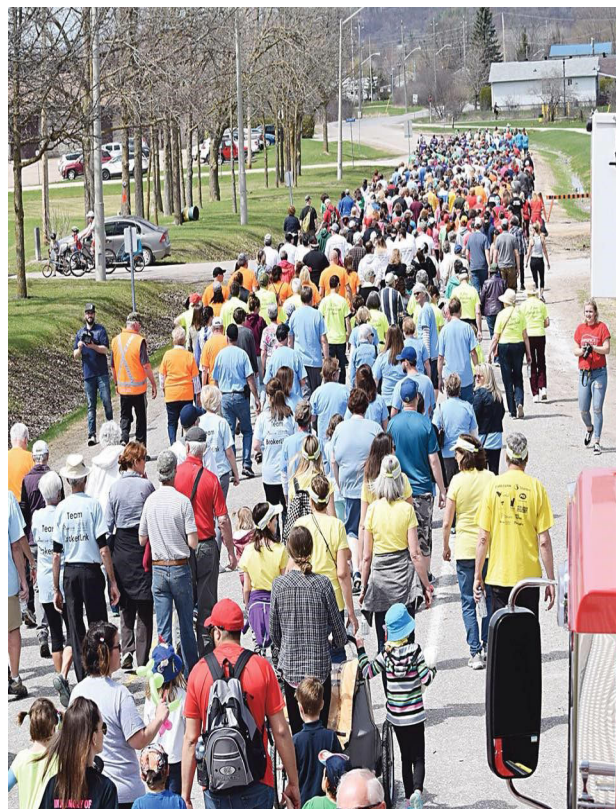
Crowd leaving Mateway Activity Center A vision to behold